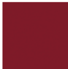
B-4310 Red Oxide